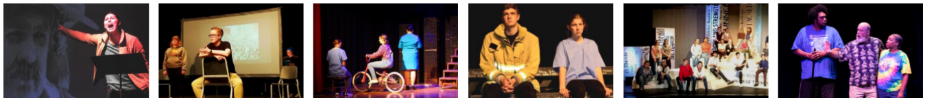
Left to right: Grafenwoehr Performing Arts Center/Army Entertainment, Glencoe-Silver Lake High, Harvard Cardinals, Ball State U, Claremont HS Theatre, ShenanArts

Published by Playscripts, 110 STORIES has been produced in over 60 academic and community theaters in over 30 states and abroad. 110 STORIES has special meaning for today's students who were born after September 11th as well as members of the Armed Forces, many of whom signed up to serve in its wake. As we approach the 20th Anniversary of 9/11, 110 STORIES is a powerful way to honor those lost and to remember the spirit of compassion inspired by this world-changing event.