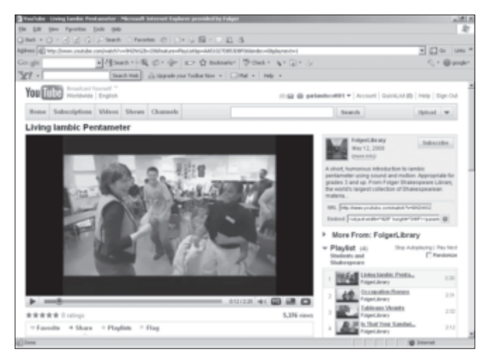
Living Iambic Pentameter, the most popular video on the Folger's YouTube channel, http://www.youtube.com/FolgerLibrary.

YouTube Shakespeare works rhetorically through imitation, parody, and irony. YouTube restricts the length and size of videos to ten minutes and two gigabytes of material, so the venue automatically encourages an aesthetic of brevity, which in turn is congenial to parody. YouTube parodies are constructed—as examples of this genre often are—through selection and condensation of the parent text. Sometimes YouTube authors focus on a single scene; sometimes they squeeze an entire play into a few minutes (much like the Reduced Shake-