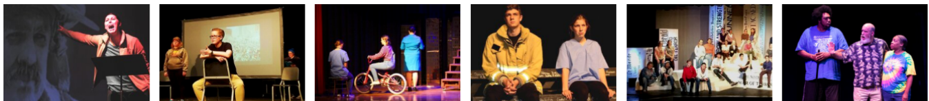
Left to right: Grafenwoehr Performing Arts Center/Army Entertainment, Glencoe-Silver Lake High, Harvard Cardinals, Ball State U, Claremont HS Theatre, ShenanArts

Published by Playscripts, 110 STORIES has been produced in over 60 academic and community theaters in over 30 states and abroad. 110 STORIES has special meaning for today's students who were born after September 11th as well as members of the Armed Forces, many of whom signed up to serve in its wake. As we approach the 20th Anniversary of 9/11, 110 STORIES is a powerful way to honor those lost and to remember the spirit of compassion inspired by this world-changing event.