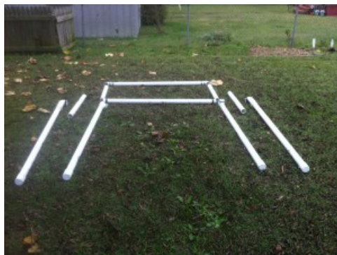
This is the stage laying on its back. The longer lengths on the sides will be a front extension, as you'll see in the next pictures.

Step 6: Slip the sheets on using the tunnels as seen the pictures. Stand up the stage if you haven't already. Get out your puppets and have fun!