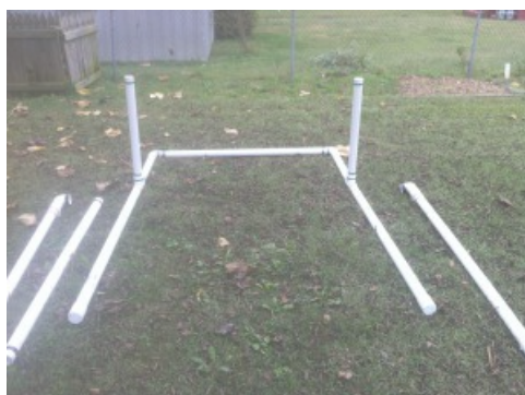
Those two pieces sticking up are the 30-inch lengths.