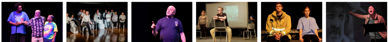
Left to right: ShenanArts, Kingsport, ShenanArts, Glencoe-Silver Lake High, Ball State U, Army Entertainment, Pasadena Little Theatre, ShenanArts

Published by Playscripts, 110 STORIES has been produced in over 60 academic and community theaters in over 30 states and abroad. 110 STORIES has special meaning for today's students who were born after September 11th as well as members of the Armed Forces, many of whom signed up to serve in its wake. As we approach the 20th Anniversary of 9/11, 110 STORIES is a powerful way to honor those lost and to remember the spirit of compassion inspired by this world-changing event.