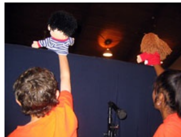
View from the inside.

I hope these instructions help you out! If you have any questions, please let me know!