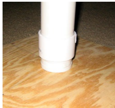
Final assembly seen here with a 2" PVC pipe inserted.

2. Cut the PVC into the required lengths. To build the puppet stage to the size indicated in the above diagram, make the following cuts: