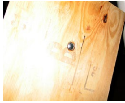
Note the counter sink allows the carriage bolt to be flush (or recessed) with the bottom of the foot.

Let this joint dry before attempting to fit the 2" uprights into this base. It will probably only take 20-30 minutes tops for the glue to dry.